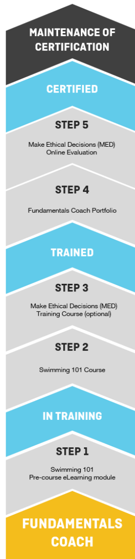
Swimmer Level: Entry Level & Regional Swimmer Athlete Development Stage: Fundamentals & Learn to Train