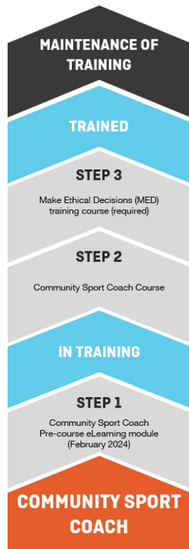
Swimmer Level: Pre-competitive Swimmer Athlete Development Stage: Fundamentals