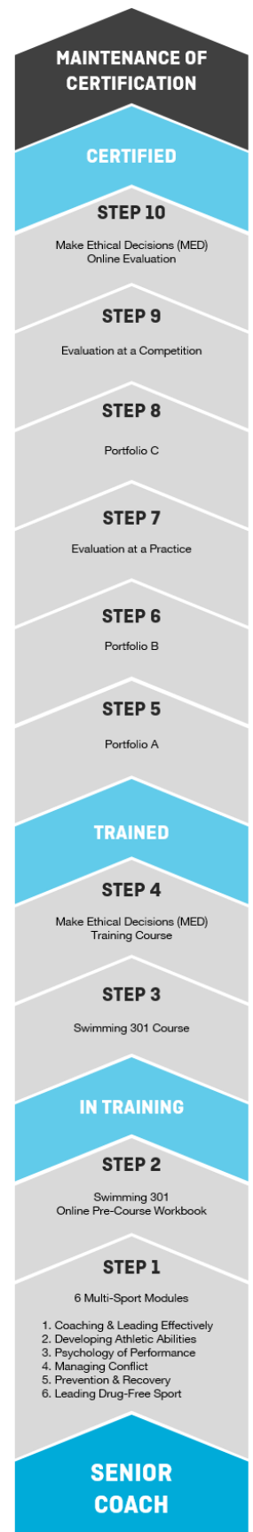
Swimmer Level: Eastern/Western Championship qualifier, U-Sport qualifier, Canadian Junior Championship qualifier, Senior National qualifier, Para CAN-AM qualifier Athlete Development Stage: Train to Train & Train to Compete