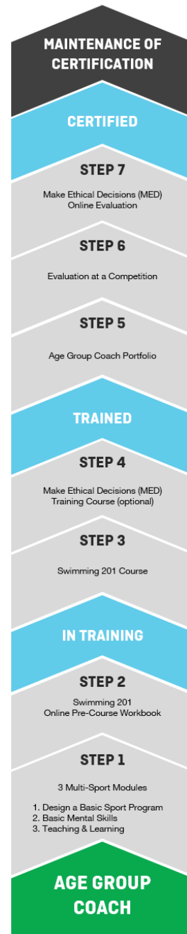
Swimmer Level: Developing Provincial qualifier to Age National & East/West swimmer Athlete Development Stage: Train to Train