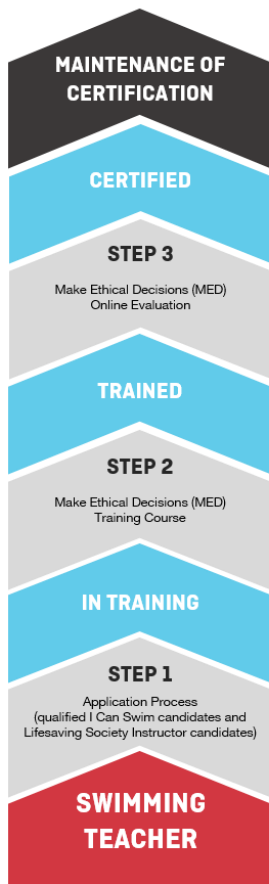
Swimmer Level: Non-competitive novice swimmer Athlete Development Stage: Active Start - Fundamentals